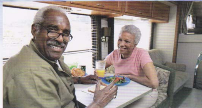
Enjoy your ride without worries with Safe-GAP Total Loss Protection.